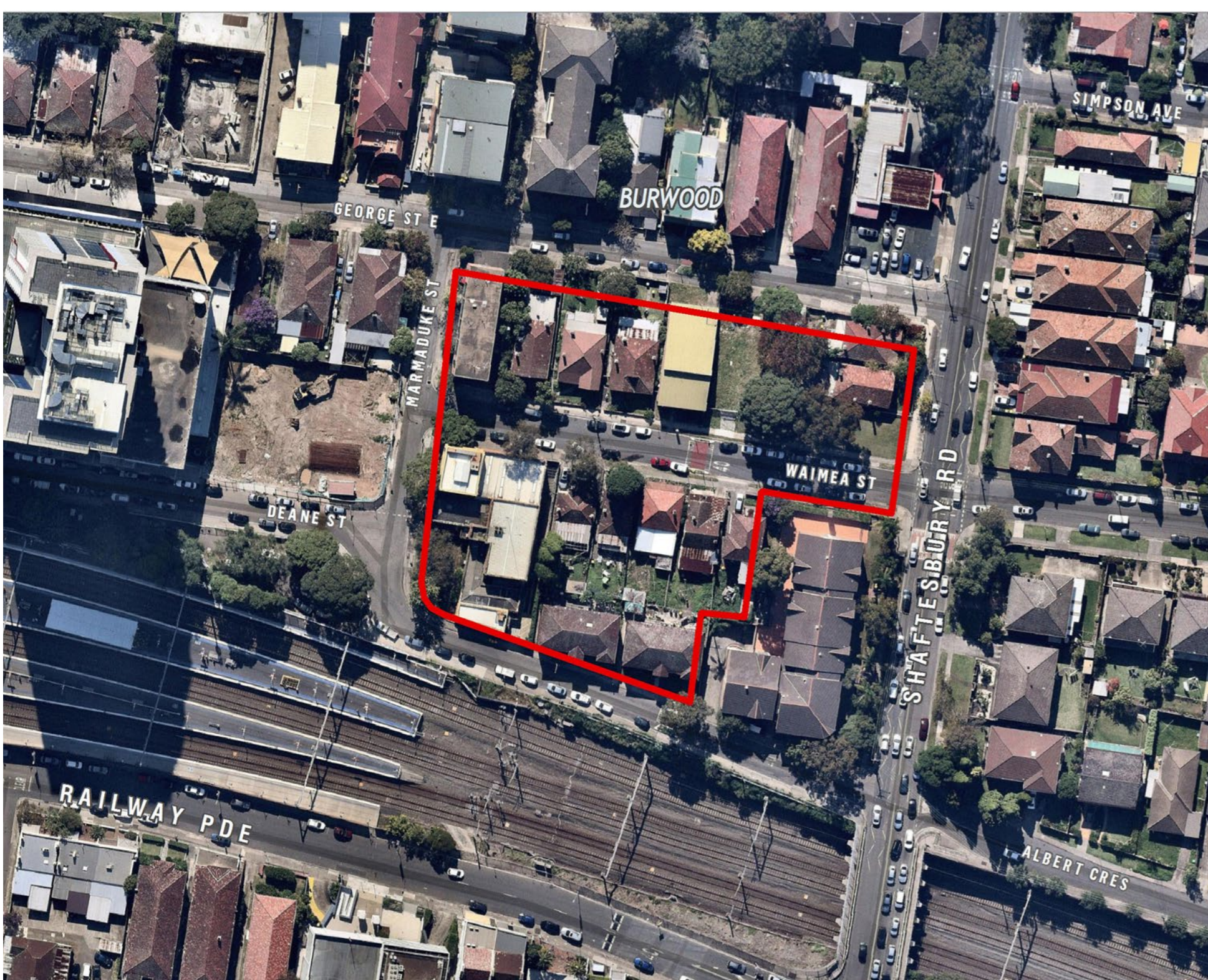
FIGURE 1 New Club location