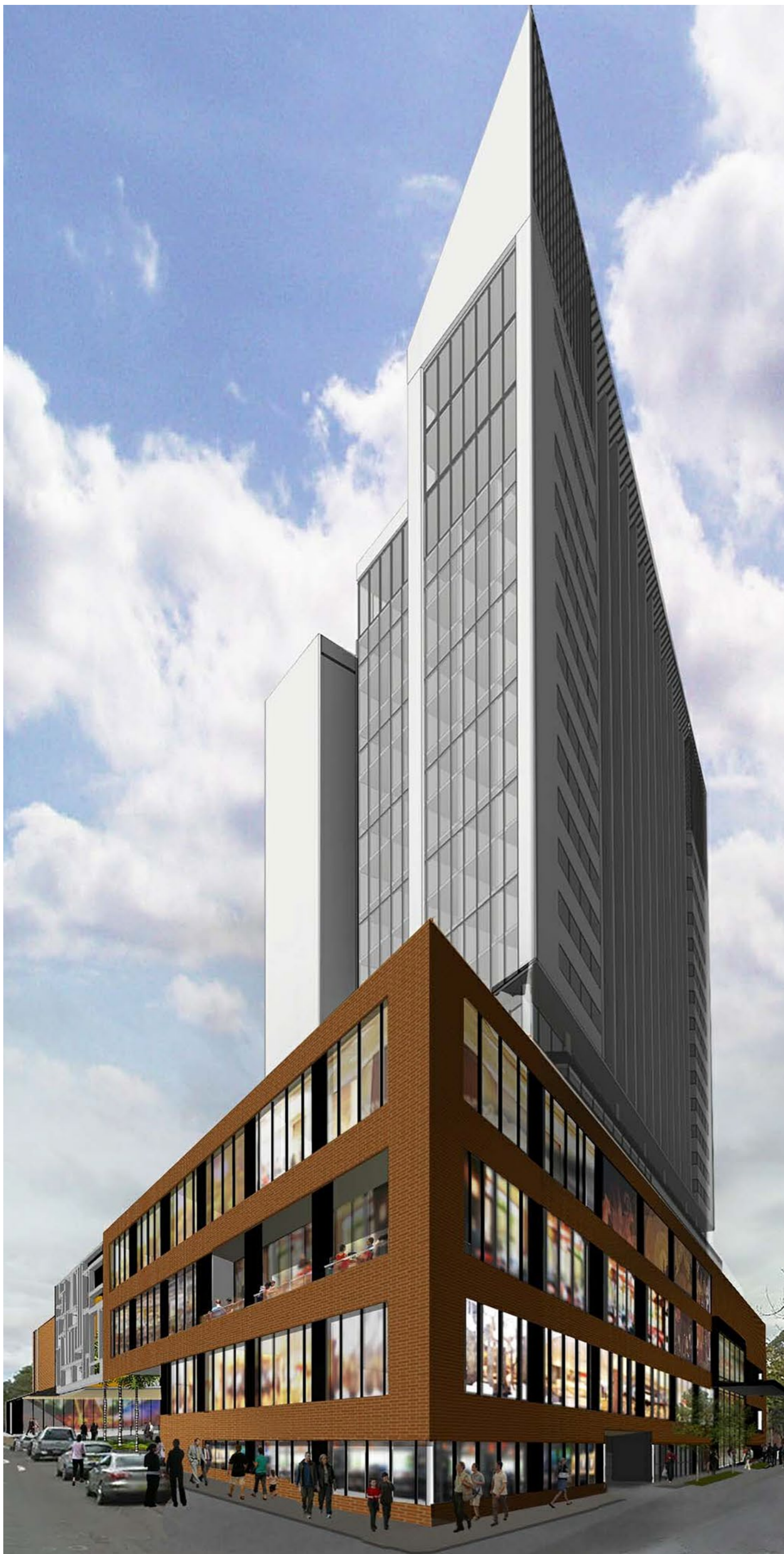
FIGURE 4 Artist Impression - corner of Marmaduke Street and George Street